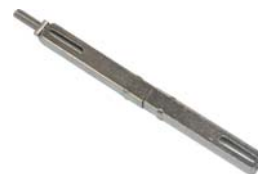
split spindle 9.10

spindle sleeve to convert 5mm spindle to suit 8mm follower