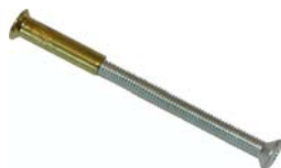
bolt through fixing screws (M5) 1.54 pr